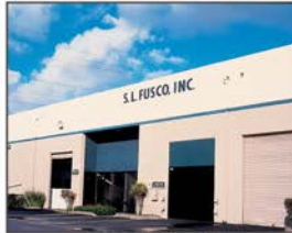
National City, CA