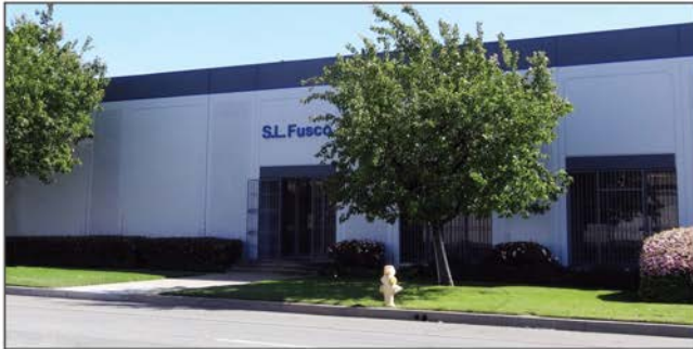
Rancho Dominguez, CA - Main Branch